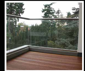
Balustrades, atriums & canopies